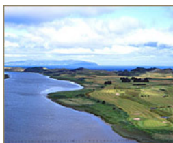
The Riverside - par 68 Includes 9 new holes running down to the river - a perfect day out for the society golfer