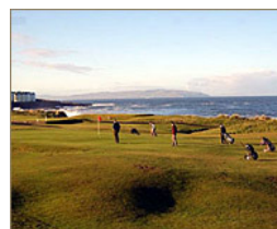
The Old Course - par 64 Along the rocky shore east of Portstewart where the Club was founded in 1894