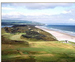
The Strand - par 72 A true championship links course The jewel in Portstewart's crown

Portstewart is one of the few Clubs in Ireland with three 18 hole golf courses and each offers something different for the Golfer. Click on the images below to learn more.